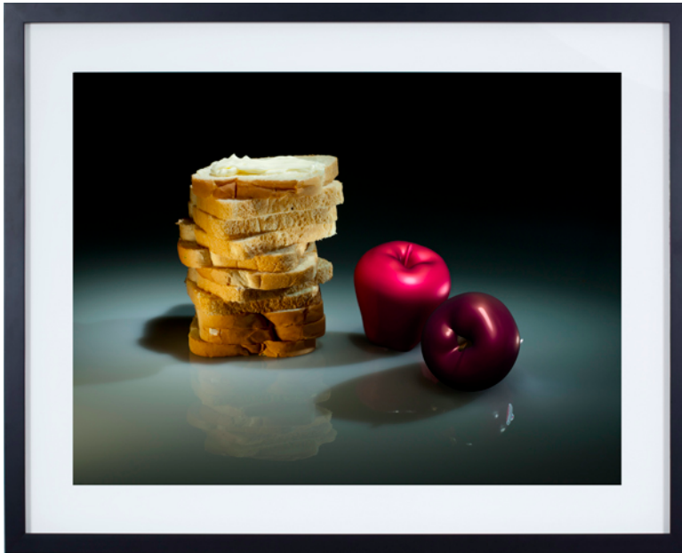
Claudia Hart, Food For Children , 2011. Archival inkjet print on photo rag, print: 36 x 48" / 91.4 x 121.9 cm, framed: 42.75 x 53.25" / 108.6 x 135.3 cm, Edition of 3.

The Real and The Fake presents Cheetos, Pringles, slices of enriched white bread, bits of chemically produced breakfast cereal, artificially made drinks, and simulated fruit juxtaposed with the digital display of an apple, which serves as a poetic reference to a Cezanne still life. What's actually real is a frighteningly fake product and what's fake is a symbol of truth (as American as apple pie) and fortitude (an apple a day keeps the doctor away.)