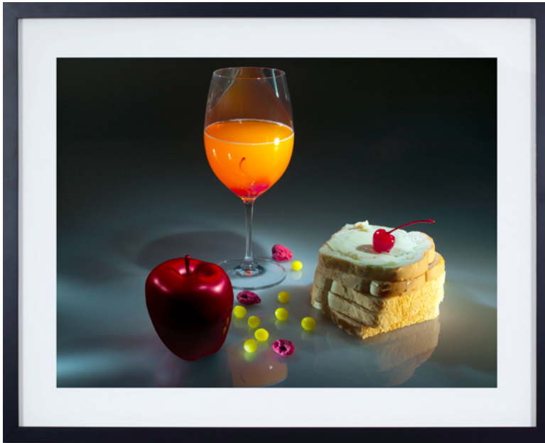
Claudia Hart, Elixir , 2011. Archival inkjet print on photo rag, print: 36 x 48" / 91.4 x 121.9 cm, framed: 42.75 x 53.25" / 108.6 x 135.3 cm, Edition of 3.

The Real and The Fake presents Cheetos, Pringles, slices of enriched white bread, bits of chemically produced breakfast cereal, artificially made drinks, and simulated fruit juxtaposed with the digital display of an apple, which serves as a poetic reference to a Cezanne still life. What's actually real is a frighteningly fake product and what's fake is a symbol of truth (as American as apple pie) and fortitude (an apple a day keeps the doctor away.)