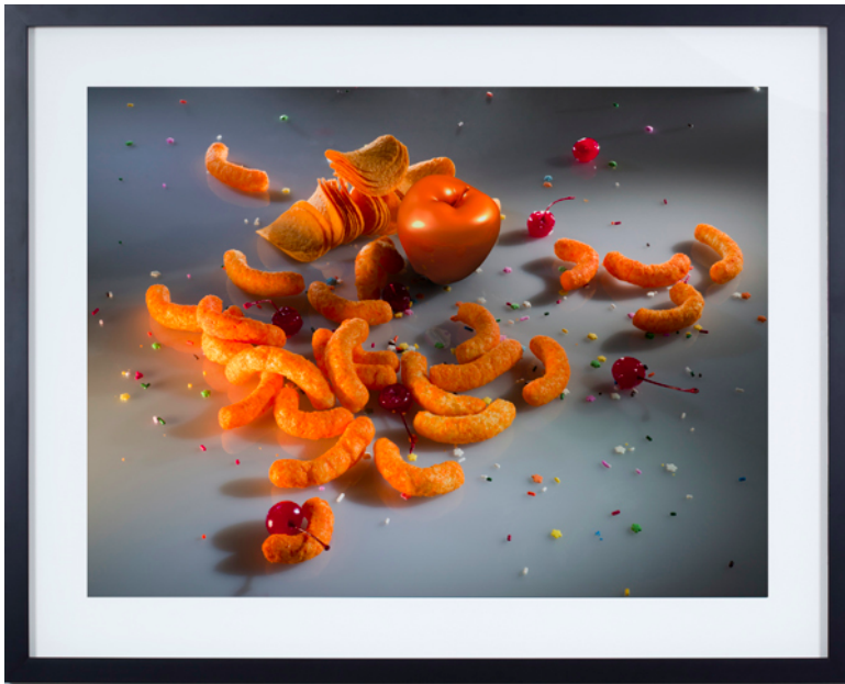
Claudia Hart, More Food For Children , 2011. Archival inkjet print on photo rag, print: 36 x 48" / 91.4 x 121.9 cm, framed: 42.75 x 53.25" / 108.6 x 135.3 cm, Edition of 3.

Not content to just create still images of the death of food via industrial production, Hart takes Steins theme of "A rose is a rose is a rose" further into the realm of memento mori with a video piece that presents a twisting female figure in a series of confining, coffin-like monitors that will kill any appetite. Pious in nature, the only way to escape this form of framed torture is to stop eating and squeeze out—but wait until after Thanksgiving!