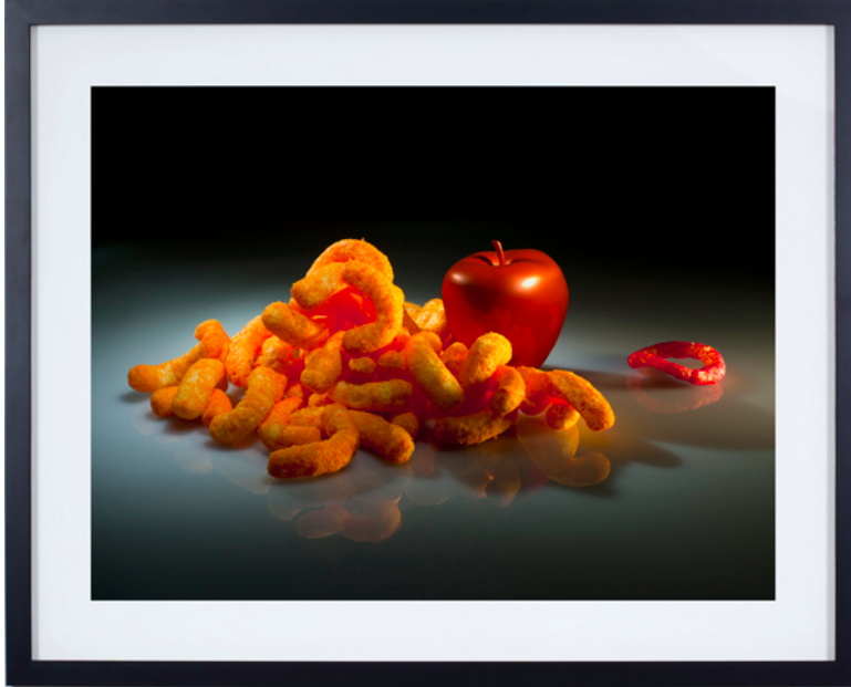
Claudia Hart, Still Life With Fundayun , 2011. Archival inkjet print on photo rag, print: 36 x 48" / 91.4 x 121.9 cm, framed: 42.75 x 53.25" / 108.6 x 135.3 cm, Edition of 3.

With dreams of turkey, stuffing, mashed potatoes, and vegetables floating in our heads, it's shocking to confront Claudia Hart's still life photos of chemically produced junk food mixed with digital simulations of apples—healthy food that goes back to the beginning of time, or at least metaphorically the Garden of Eden. The Chicago-based digital whiz references a Gertrude Stein poem in her show When A Rose is Not a Rose at New York's bitforms gallery and plays with the Modernist vision of the still life in clever ways in her new series of photographs.